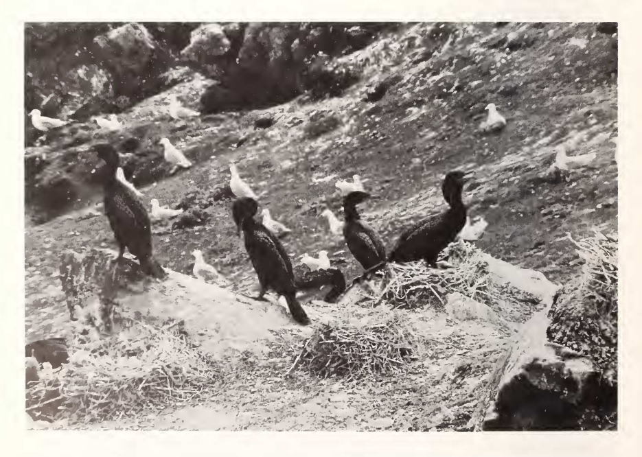
Fig. 11. Double-crested cormorants and nests with eggs; Shaiak Island, 14 June 1973.

The number of nesting pairs on Shaiak Island varied from 125 in 1973 to 300 in 1976. Nests were clustered on low, broad ledges, on flat rocks, or on the ground, mostly on the highest parts of the island. Sixty clutches averaged 4.23 \pm 0.90 eggs per nest (range, 3–5) on 14 June 1973. Thirteen pairs fledged 1.62 \pm 0.18 young per nest (range, 1–3) in 1976; egg laying began about 7 June, hatching was from 2 to 10 July, and fledging was from 7–29 August 1976. At least six pairs on partially completed nests were on Bird Rock on 21 May 1973, and J.L. Hout (personal communica-